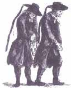
Fig. 1. Grieving men with hat with mourning streamer, 18 th century.

However, Shihei certainly will have told Chūryō 55 the details, how by order of the incumbent Chief Arend Willem Feith, on the day of the funeral, the flags were hoisted halfmast 56 , and the coffin, covered with a 'fabita', a satin cloth, was carried down from the steps of the Watergate, where it was transferred onto a boat and rowed across Nagasaki Bay to the opposite side. In a second boat, displaying the VOC-emblem, the Chief Factor was seated. Then the climb to Goshinji on the foothills of Mount Inasa and so to the 'Hollandsche Begraafplaats', the Dutch cemetery 57 , with all the Dutch following the coffin, clad in the black mourning dress and with a long black mourning streamer ( D. lamfer ) attached to the back of the hat. 58