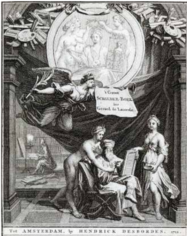
Fig. 11. Gerard de Lairese, frontispiece, showing the symbol of Fame flying with huge wings while blowing the trumpet to proclaim the greatness of De Lairese (sitting in the chair, bottom right).

Shiba Kōkan, on the other hand, mentions, in regard to the symbolic interpretation of the wings, that Dutch images are often a metaphor, where winged people and other figures are shown as symbols. Here he may have had angels in mind. The more so as he says winged people do not exist on earth. Kōkan's inspiration for this thought probably originates from drawings he found in two Dutch books he owned: Gerard de Lairese, 't Groot Schilderboek and Johannes en Caspaares Luiken, Spiegel van het menselijk bedrijf . 105 The frontispiece of Lairese's book shows the allegoric effigy of 'Fame' depicted as an angel with huge wings and blowing the trumpet. The frontispiece of Luiken's book shows many chubby cherubs floating in the air.