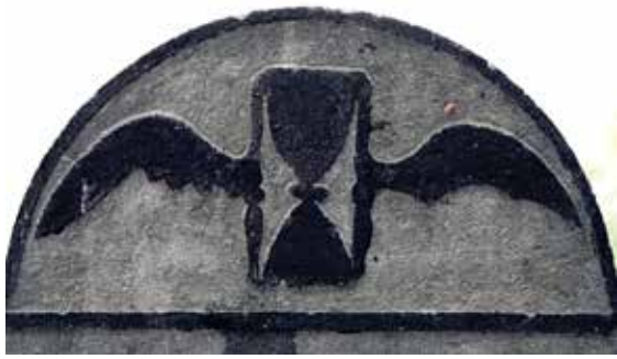
Fig. 7. Emblem of a winged hourglass with dove wing and bat wing, churchyard in Zoutkamp, Groningen, The Netherlands.