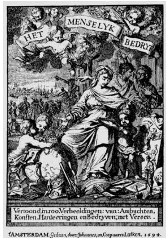
Fig. 12. Johannes en Caspaares Luiken: 'Spiegel van 't Menschelyk Bedrijf , frontispiece with winged cherubs floating in the air.