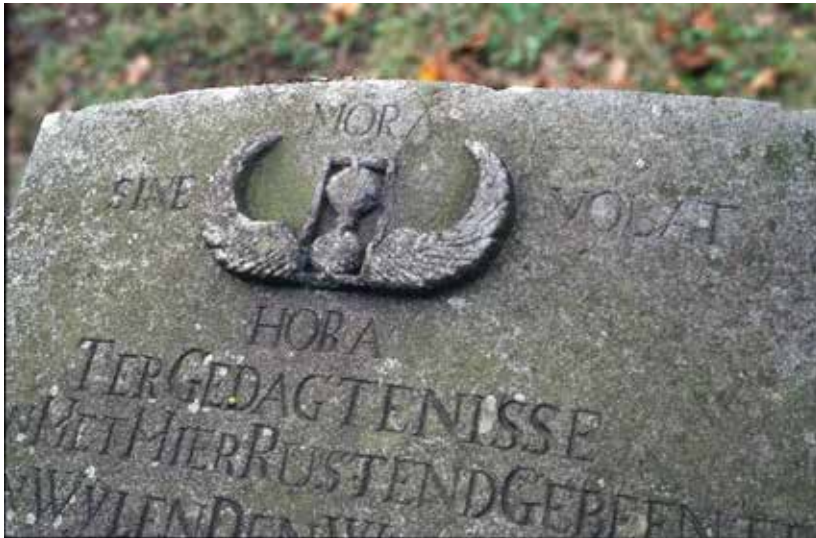
Fig. 9. Emblem of the winged hourglass on Duurkoop's tomb, Goshinji, Nagasaki, Japan.

Regarding the carving of the emblem on Duurkoop's tomb, it should be noted that on gravestones in the West the wings are attached to the narrow neck of the hourglass and, what is significant, the wingtips always point downwards (see Fig. 6 and Fig. 7), whereas on Duurkoop's gravestone, the bird wings, are attached to the lower end of the hourglass and the wingtips are pointing