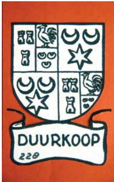
Fig. 16. The Family crest of Charles Duurkoop, skipper of the VOC.