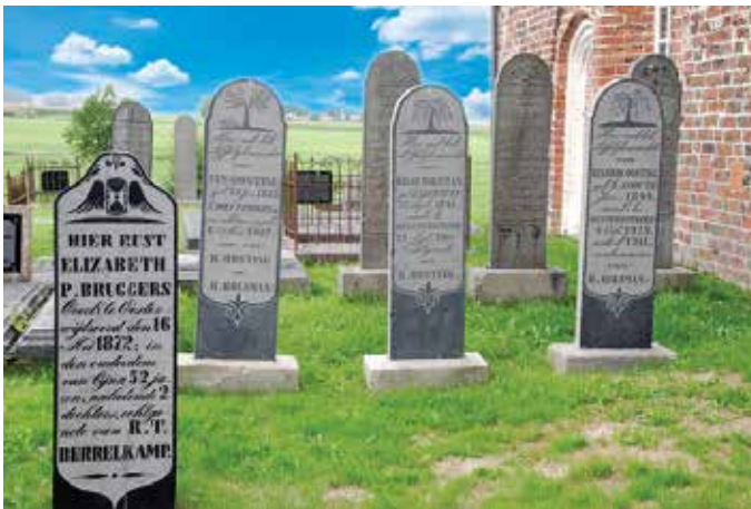
Fig. 6. Gravestone with winged hourglass in churchyard of Oosterwiltwerd, Groningen, The Netherlands.

A winged hourglass is a well-known symbol on Dutch graves since the 16th century. 92 On old gravestones in the northern part of the Netherlands, e.g. in the province of Groningen, this emblem still can be found. (Fig. 6).