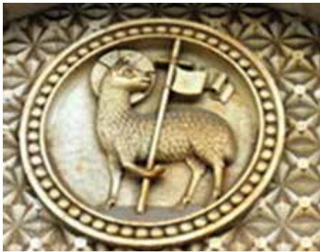
Fig. 15. An example of a traditional decoration with Lamb and Cross: Lamb (with nimbus) holding with his front leg a Cross with banner.