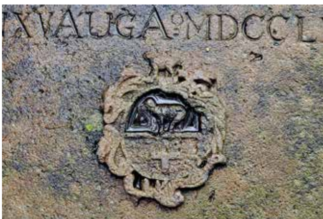
Fig. 14. The emblem below the epitaph. Photo taken on a rainy day in 2015 after the cleaning/conservation in 2012/13.

After having discussed comprehensively the views of several Japanese and other authors regarding the symbolism of the winged hourglass at the top of the epitaph on Duurkoop's gravestone, we now should turn our attention to the other interesting engraving at the bottom of the epitaph. Shiba Kōkan sketched it roughly (see Fig. 4), while in Harufusa's drawing it is more accurately drawn. Although somewhat affected by the ravages of time, today it is still clearly visible. (Fig. 14).