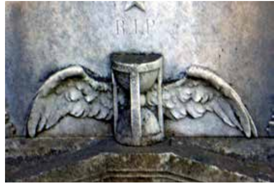
Fig. 8. Winged hourglass in Sakamoto International Cemetery, Nagasaki, Japan.