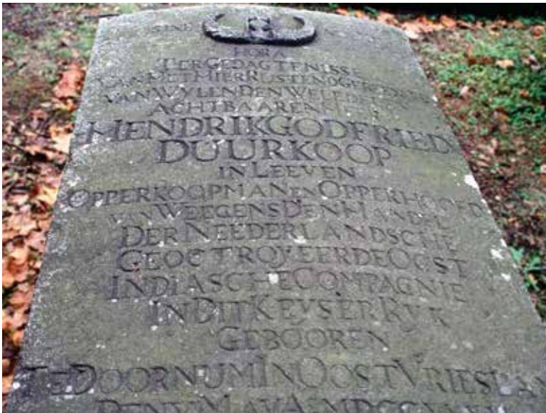
Fig.3. Duurkoop's tombstone, the epitaph.

Unlike the inscriptions on Dutch graves in preceding centuries, testifying to the belief that death was the liberation from the sorrows of earthly existence with paradise as redemption, inscriptions on Dutch tombstones in the eighteenth century show a person who was more aware of his own abilities and, although still strongly religious, appears selfconfident and keen to show what he had accomplished in life. The tombstone was a memorial. The epitaph indicates not only name, date and place of