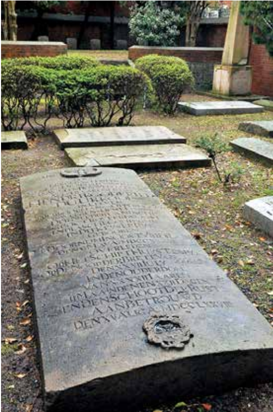
Fig. 2. Duurkoop's tombstone in 2015 at The 'Hollandse Begraafplaats'.

has been designated an "Important cultural Treasure" of Japan.